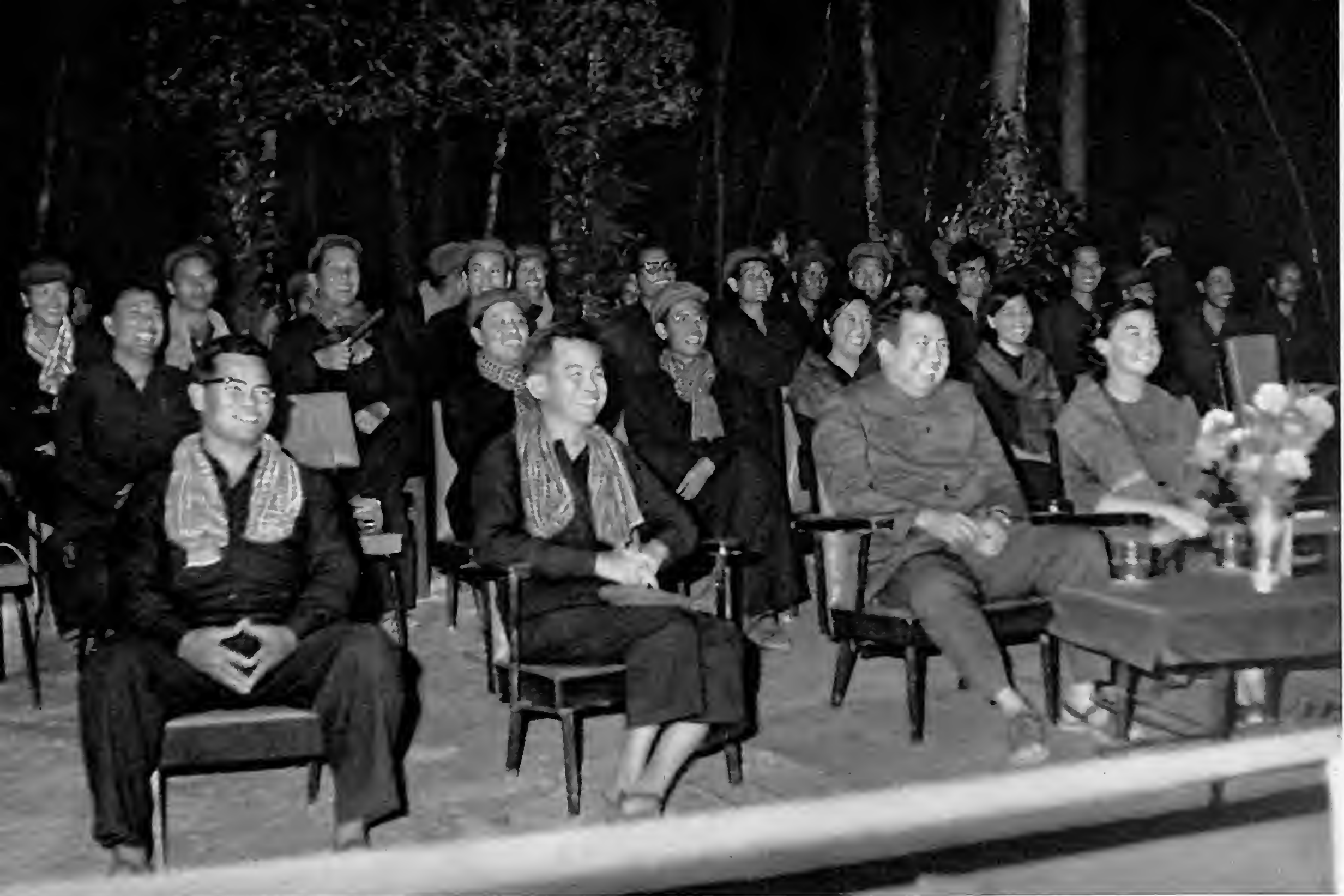
Samdech and Madame Sihanouk at a performance presented in their honour by the P.A.F.N.L.C.